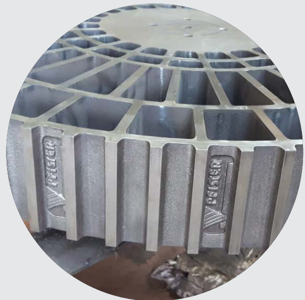
After the repair service