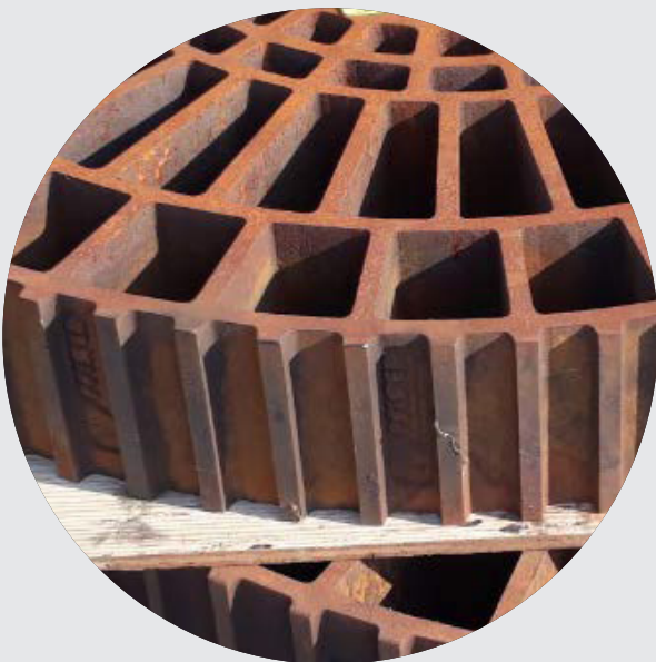
Before the repair service